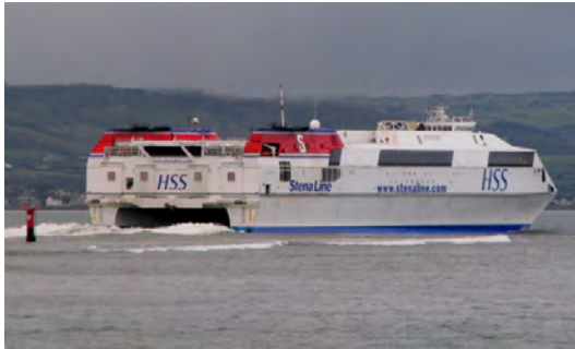
HSS Stena Voyager leaving Belfast Harbour

The HSS berth was moved seaward to Victoria Terminal 4 in 2008 to accommodate large HSS vessels. Significant bed protection works were required to the berth to protect the piled combi wall span height and embedment depth.