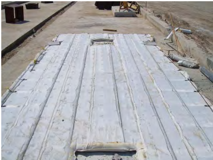
Bearing with Block Removed