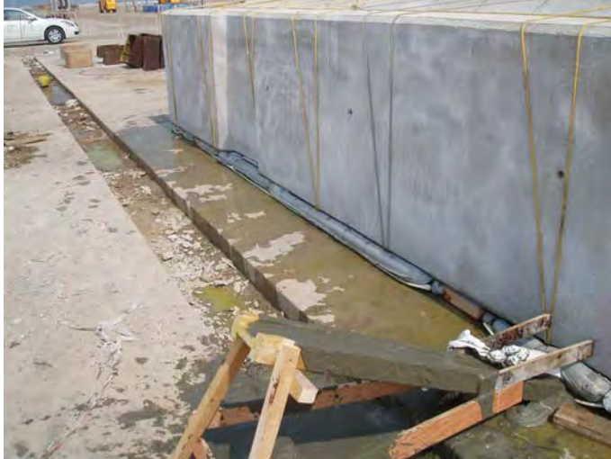
Grout Bag Bearing Test