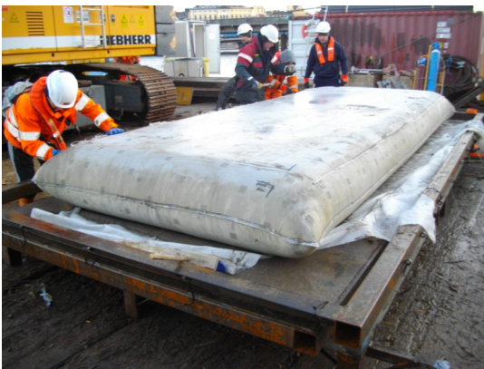
Grout Bag Test Filling

Proserve Engineers, in agreement with the Main Contractor and Diver, designed the foundation grout bags system to overcome the challenges of sloping and undulating pile caps, close proximity to temporary jack supports during filling and restricted access to the grout bags once the tunnel elements had been positioned.