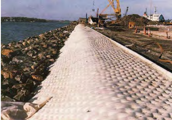
Stranraer Port, Scotland