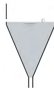
Proserve Flow Cone Volume 1.75 litres

The water: cement ratio is adjusted to give a discharge time of 27-33 seconds