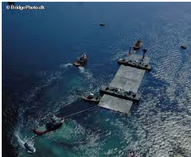
Tunnel Section Being Floated into Position

The central closure between elements was formed insitu. To avoid releasing the compression in the rubber seals a fabric formwork unit was placed between bearings, and then grouted to ensure a perfect seal.