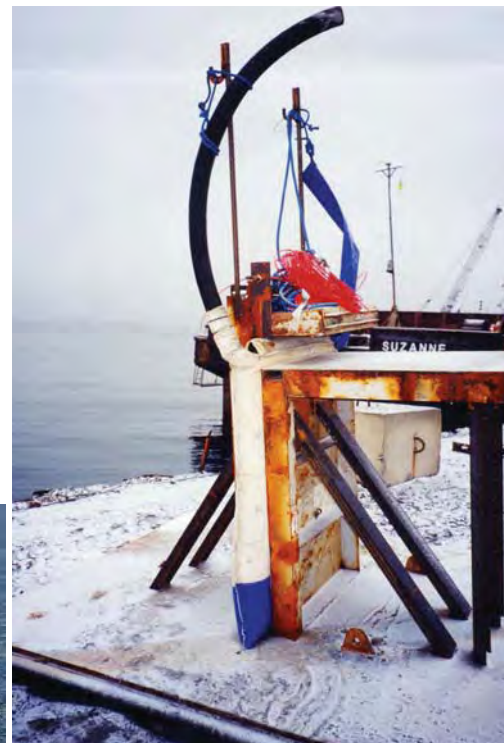
Filled Pro-type Seal

A prototype test rig was made in steelwork and lowered to the sea bed for trial filling, and installation team training.