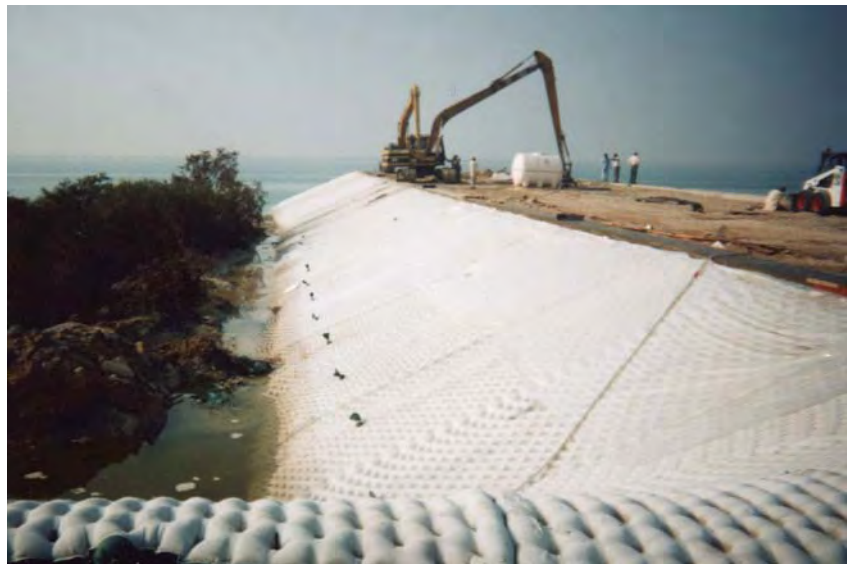
Laid & Filled Mattress Along Embankment

Site installation support was provided by a Proserve Engineer