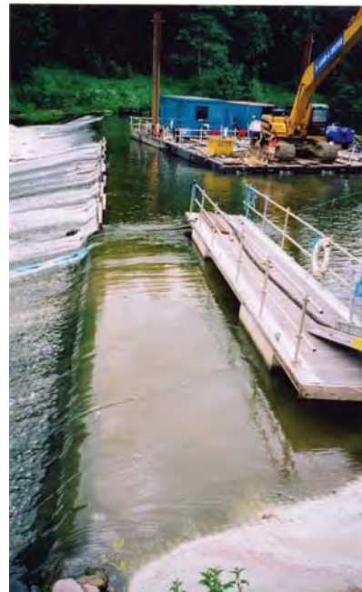
Mattress Construction Progressing Across Weir