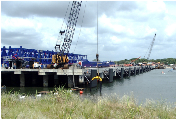
Fig 1. (North view) Toyo dredging in progress

A newly constructed piled jetty at Puerto Quetzal, Guatemala requires berth scour protection to combat against vessel scour action to the slope and wave zone beneath the jetty.