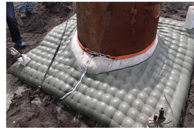
Fig 2. Pile-seal sample

The fabric formwork mattress has been engineered by Proserve to securely seal around the 500+ piles supporting the jetty deck. After dredging and preparation to the required slope, the mattress system is laid and filled. 59 N° mattresses are to be installed as single panels, typically 6.05m to fit between pile rows and each 55 m in length, each panel locking to the adjacent with zipped ball and socket joints.