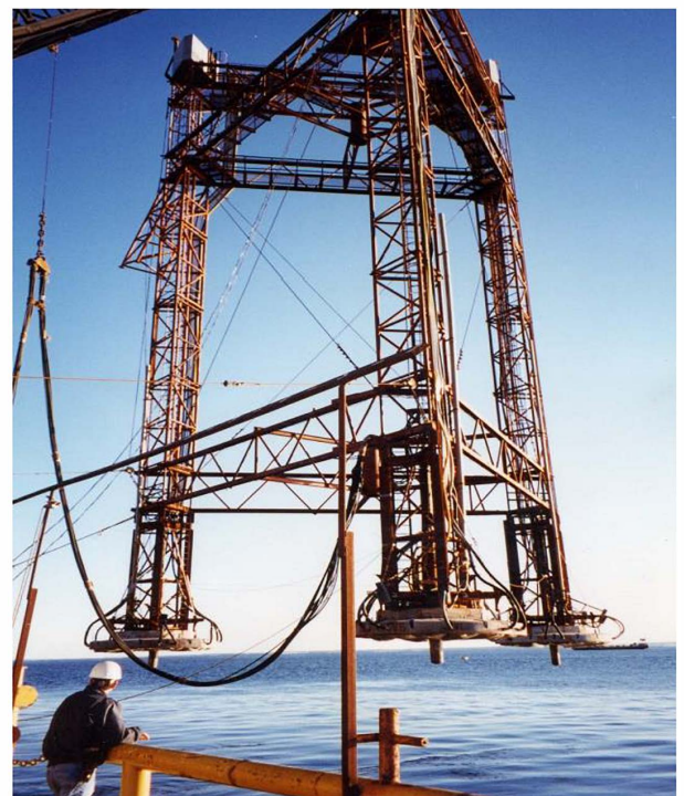
Hard Pad Installation Frame