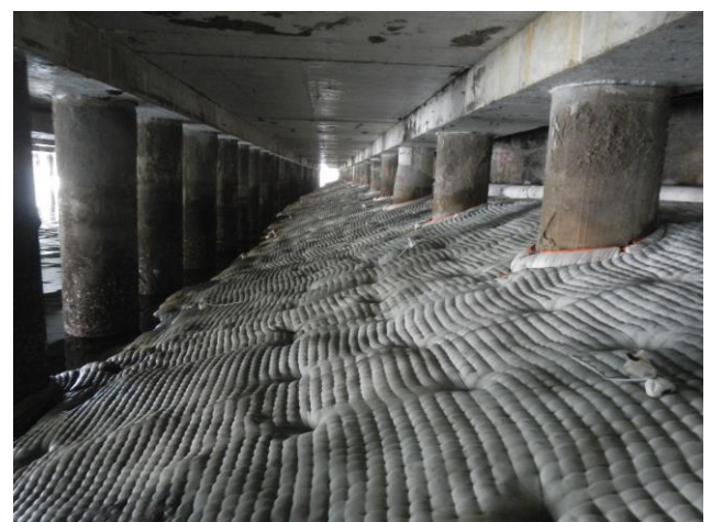
Open Hole Mattress

Open hole mattress is used in the wave zone. This comprises a 220 mm thick concrete mattress with 90 mm Ø open holes at 1 m c/c to create permeability. This is laid over a bedding stone layer and sand-tight geotextile. The bedding stone and geotextile is installed immediately after excavation to provide temporary protection before mattress is laid. The mattress can be readily laid over undulating surfaces, as shown.